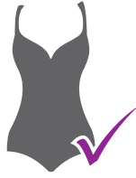
ONE PIECE SWIMSUITS