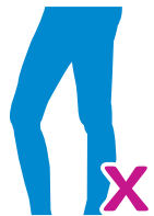
COMPRESSION PANTS OR SHORTS