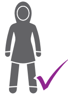
RELIGIOUS SWIM WEAR LIKE BURKINIS