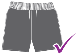
BOARD SHORTS, SWIM TRUNKS, OR SPORT SHORTS