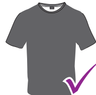
SHIRTS OR RASH GUARDS