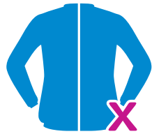
JACKETS OR HOODIES